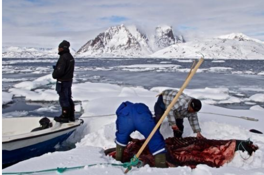
Figure 4: Hunters butchering a hooded seal – hunted by boat - on a floating iceberg the April 21st, 2017. Usually in that period of the year is not possible to go hunting with boats around the fjords.

In this scenario, it is crucial to understand that Mads does not use dogs for recreational activities. Since it seems difficult to hunt with dogs, he prefers to get rid of most of them. He just kept a few for the occasions the ice blocked the access to the sea and to have a small pack that can reproduce if next season will be better. According to Mads, in 2017 there was also a notable lack of seals in the sea. It is not possible to address the exact reason of this scarcity but some local hunters connected this shortage to the higher temperatures compared to previous years. Several mushers pointed out the differences in the ice and temperature compared to the past. For example, Moses reported how much colder the region was in the past – “For fifteen, twenty years is [was] different, more cold. Right now, about 0° Celsius. For fifteen, twenty years ago about maybe -10° right now. And the ice is not good right now. Old days we can drive to July” (A.F. 7:1, 2017). Such hope is probably based on the fact that a certain unpredictability in the weather has always been present in his life in Kulusuk, and he can remember similar periods in the past or as states: “Fifteen years ago we got two years no ice, open water all months. [...] So, maybe next year is good again. Like the seals, maybe next year a lot of seals” (A.F. 7:1, 2017).