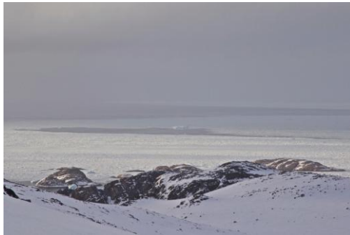
Figure 5: View of the sea ice from the mountain of Kulusuk on February 12 th 2017. The open ocean is visible not too far off the coast.

changes in mobility patterns (Buijs, 2010). The hunting grounds change as species migrations shift, and more unreliable ice modifies the sled dog's season. As Peter Bosold explains, things changed a lot since he was young. When going to the mountain with his family and friends he was not able to see open sea in wintertime but only a huge field of ice kilometers away from the coast. Now, even in February, the floating ice is scarce and not homogenous out in open water (Figure 5). Open water is a critical factor limiting the formation of solid pack ice, since waves are one of the main reasons the pack cannot stabilize and be uniform.