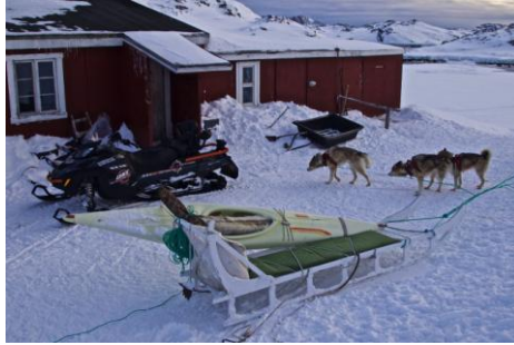
Figure 2: The dichotomy of snowmobiles and sled dogs intensely represents the processes of reconceptualization in Greenlandic culture. For certain Greenlanders, the two are tools that are able to coexist; for others, snowmobiles are the replacement of older means of mobility.

Undoubtedly, rural areas represent a particular case. Hendriksen (2014) analyzed the effect of urbanization in Greenland - the tendency to move into larger towns, where job opportunities seem to be more prevalent than in small settlements. Without entering in the debate of the reality of these opportunities, leaving small settlements for more urbanized areas is more likely to happen under specific circumstances. According to Hendriksen (2014), migration to towns increases when opportunities and resources are lacking in small communities. When resources and subsistence activities are still available, people tend to remain in settlements. For example, in communities where the sealskin market has been historically significant but ceased to be profitable it would be more likely to witness depopulation in the area. The airport of Kulusuk makes the village a gateway to the rest of the region. Opportunities for tourism development are therefore consequently higher than in other settlements of the region. Relating this to sled dogs, it does not seem strange the high dependency of a certain number of mushers on tourism. Kunuk addresses how his family has two packs of dogs because of tourism; otherwise, he would use the dogs of his father to go out for recreational activities.