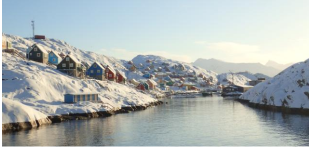
TABLE RONDE INTERNATIONALE DE LA RECHERCHE ET DE LA CRÉATION SUR L'IMAGINAIRE DU NORD, DE L'HIVER ET DE L'ARCTIQUE