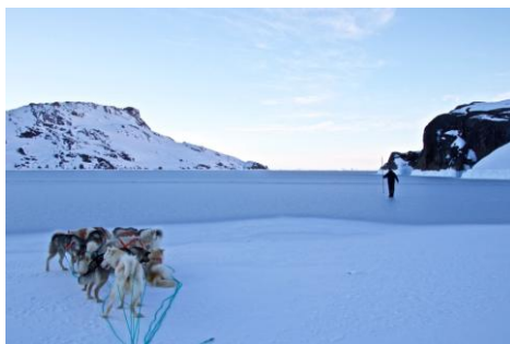
Figure 6: A hunter checking the thickness of the ice in one of the hunting grounds. In this area, edge hunting was traditionally conducted throughout the entire winter since the water didn't freeze. In mid-March, colder temperatures resulted in a layer of ice too thin for nets and sledding, but too thick to provide open water.

best mushers of Ammassalik. Unfortunately, in the winter of 2017, such a race was not possible due to the bad ice conditions in most of the villages. As for many of the Kulusummiut , Buijs (2010) reported how Ammassalimmiut observed the changes in the sea ice that now tend to appear later in winter, disappearing earlier in the end of spring. For the hunters, the inability to forecast conditions year after year is a constant worry. Like Moses, Peter also hopes for the return of stable winter seasons, and states that they “always do so”. Climate change is already altering the current way of living, and Kulusummiut try to adapt, as they have always done, to unpredictable changes (see Figure 6).