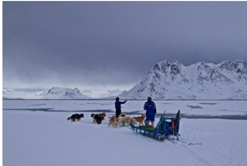
Figure 3: Hunters observing the pack ice that has already started to break in February. The limited extent of the pack ice results in less mobility with sled dogs and smaller hunting grounds.

compromised. Luckily, at the end of February conditions got slightly better, and the pack ice got more reliable. However, the ice extent was really limited, and so were the hunting grounds. In some areas, close to open sea, hunters needed to take out the nets in the end of February, since the fragile ice was already breaking (Figure 3).