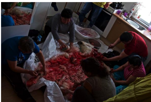
Figure 1: Women, and the male hunters, are experienced in cleaning and butchering polar bears, a process which can take several hours. The polar bear hunt is one of the most meaningful traditions for Greenlanders.

information (Pink, 2007). The meaning of photographs can of course vary depending on their context. In this case detailed variations in dog use continually revealed themselves and photography proved the most efficient tool to frame and record these behaviors. The aim of the visual material is also to engage with the temporality of tradition in Kulusuk. In fact, tradition has always been present and produced by people throughout time, according to experiences and historical context (Harvey, 2001). Traditional culture provides knowledge of standards, values, and practices of everyday life. Nevertheless, these assets are interpretations of individuals that continuously transform and evolve them (Bujdosó et al., 2015). The visual material therefore presents how the traditions of Kulusuk are practiced today.